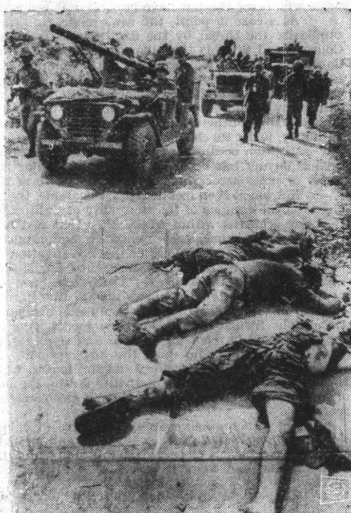
THE OPEN ROAD — Soldiers of the 1st Infantry move past bodies of Viet Cong guerrillas on Highway 13 near Lai Khe, South Viet Nam, following a fierce battle to clear the highway for a South Vietnamese troop convoy. At least 400 Communist guerrillas were killed in the seven-hour battle.