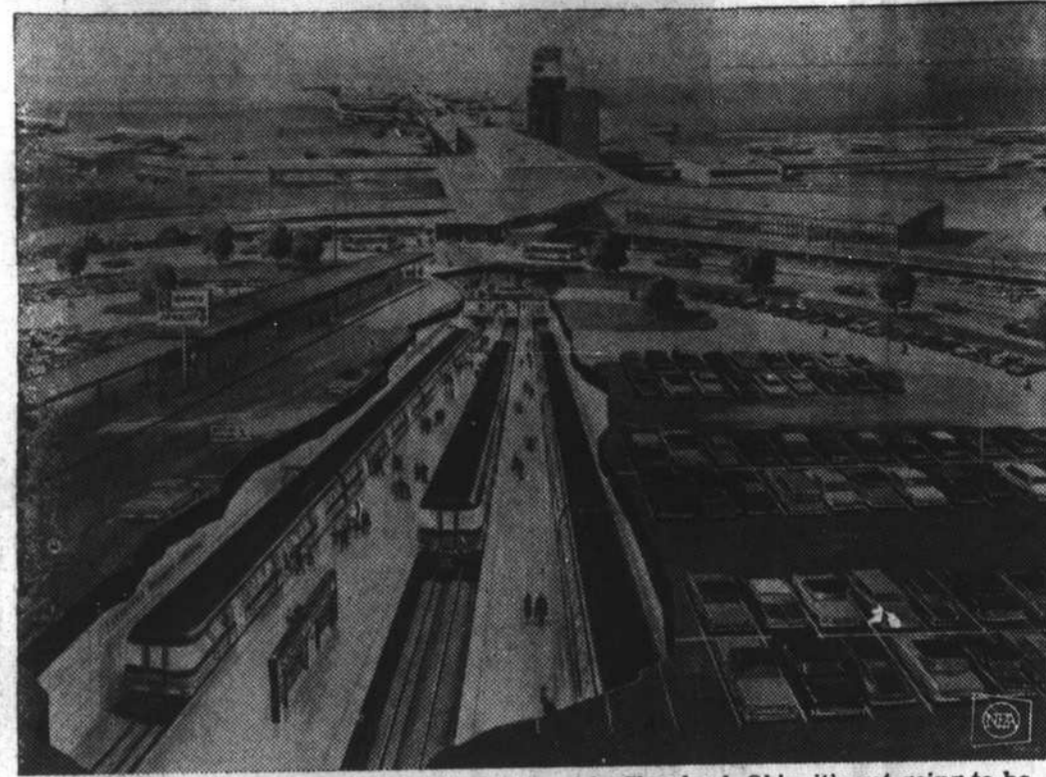
CATCHING UP WITH THE AIR AGE—At least in Cleveland, Ohio, it's not going to be possible in the future to say that it takes longer to get to the airport than to fly to a distant city. The Ohio metropolitan area is soon to mark a first in the nation with direct rapid transit connections between airport and city center. When a four-mile extension of the present system is completed in 1967, Cleveland Hopkins Airport will be only 20 minutes from the heart of downtown. Elsewhere in the world, only Tokyo and Brussels have similar service. Sketch shows airport terminal, only a few steps away from check-in and baggage counters.

Another nuclear powered submarine has been in the Western Pacific and have visited Japan but the Enterprise and the Bainbridge were the first nuclear-powered ships to join the Viet Nam war effort. They joined other 77 fleet ships already stationed off Viet Nam.