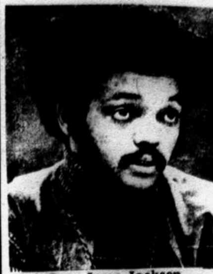
Rev. Jesse Jackson