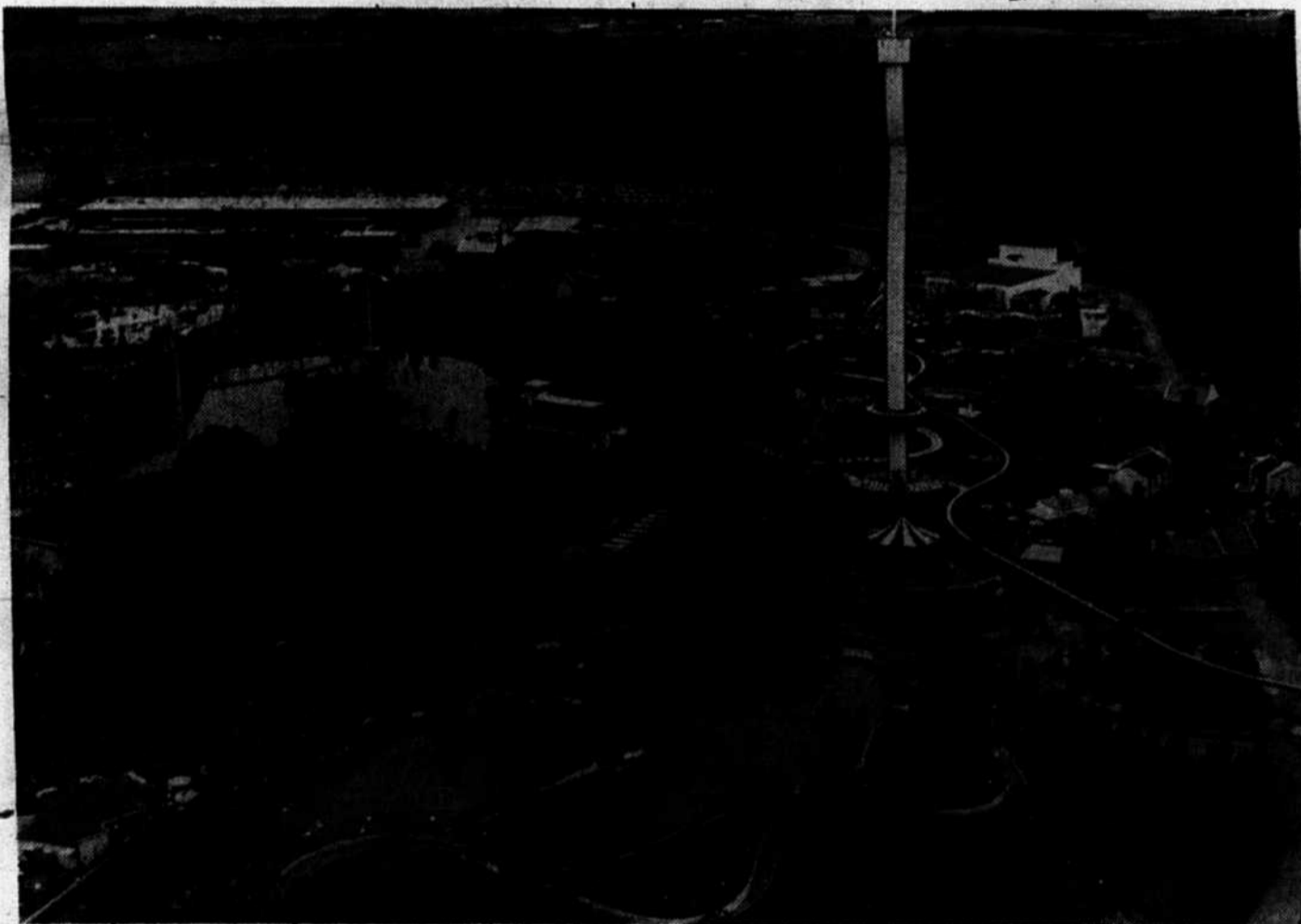
AN AERIAL VIEW of the beautiful scenery at Carowinds includes the 400-passenger riverboat, the 340-foot skytower.

Keep your out-of-town friends informed on what's happening in Charlotte by sending them a copy of the Charlotte Post each week. A year's subscription costs only $5.20.