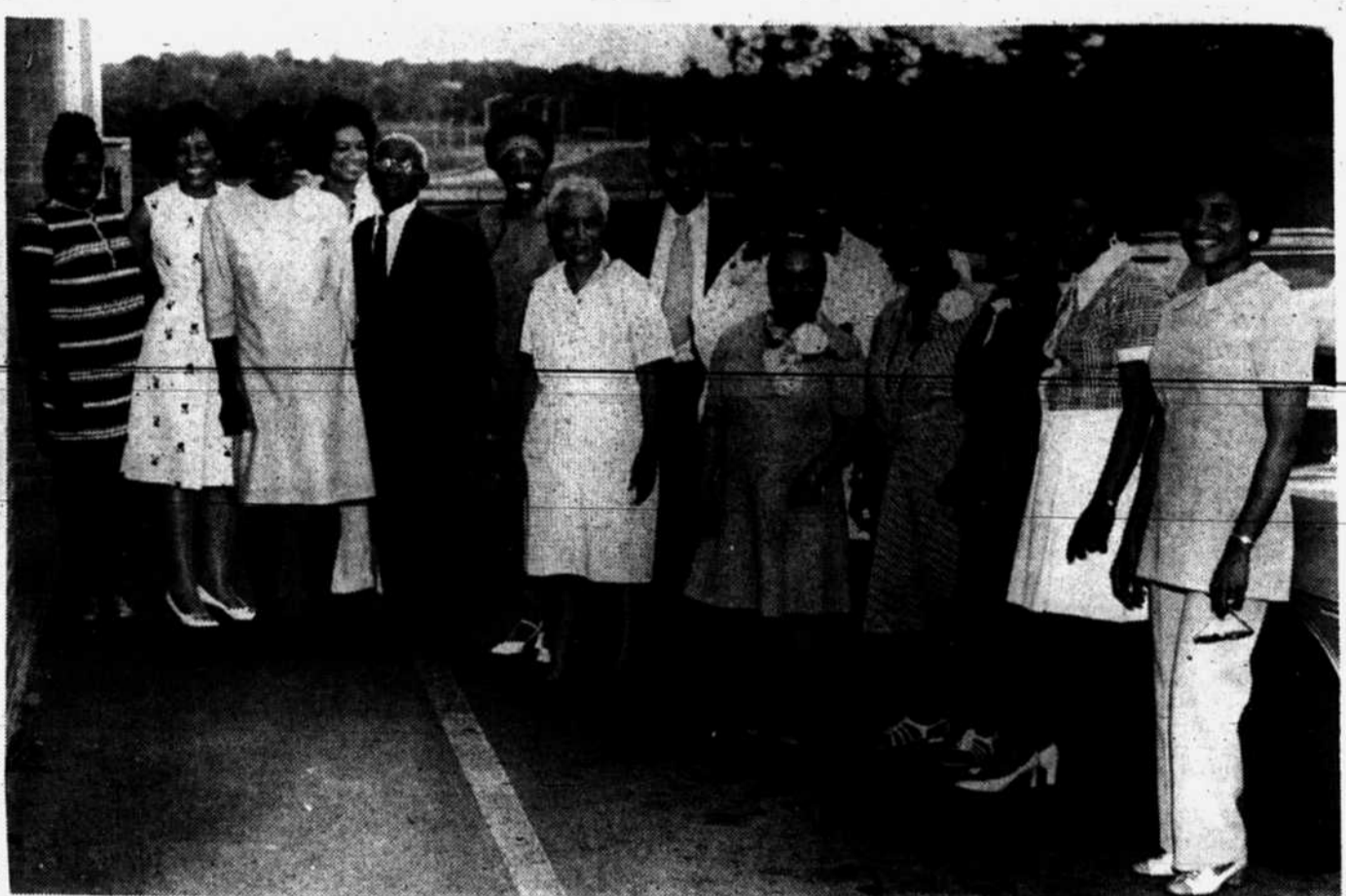
REST HOME RESIDENTS from Aery's Nursing Home disembark from cars in front of Georgia's Restaurant where members of Alpha Kappa Sorority treated them to a lovely