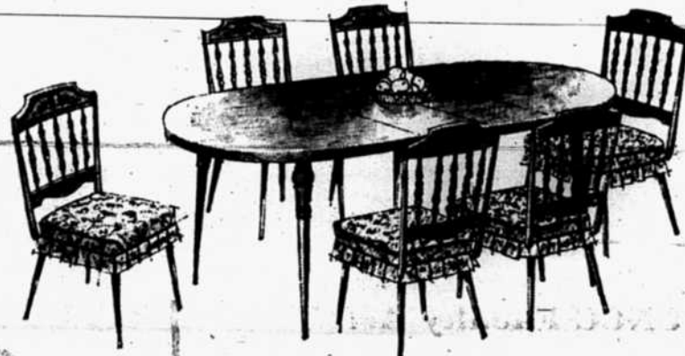
Regal by Chromcraft 7 pcs. $249

Sophisticated as well as practical. New wrap-over upholstery features soft Tucson expanded supported vinyl. Button tufted chair backs and fronts. Table top of melamine plastic is 36" x 48" and extends to 60" and 72" with leaves. Sturdy Brown 'n Brilliant legs. Chairs have lifetime metal seats and custom contoured Ultra Foam cushions.