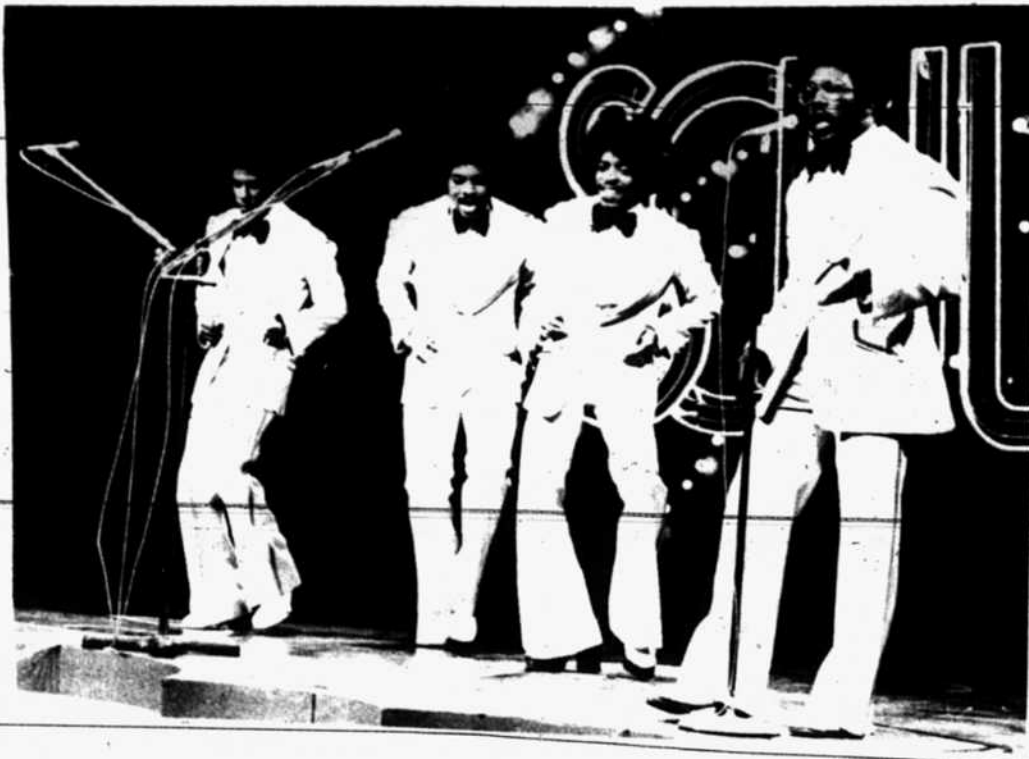
THE POPULAR JONES ... Famed Rock 'N Roll Group

According to United Artists, "Amazing Grace," with Moms Mabley and Slappy White is racking "amazing grosses" in such cities as Atlanta, Pittsburgh, and Memphis.