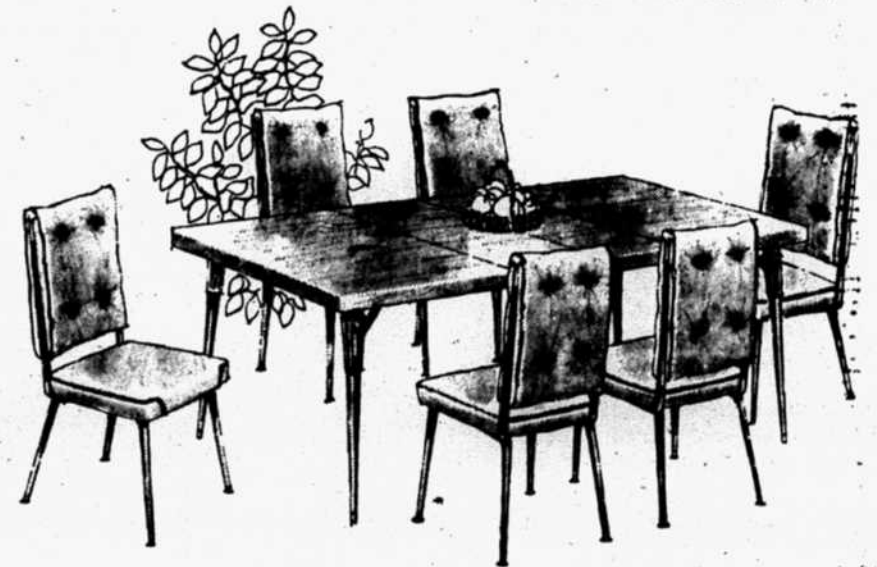
Empire by Chromcraft 7 pcs. $249

Sophisticated as well as practical. New wrap-over upholstery features soft Tucson expanded supported vinyl. Button tufted chair backs and fronts. Table top of melamine plastic is 36" x 48" and extends to 60" and 72" with leaves. Sturdy Brown 'n Brilliant legs. Chairs have lifetime metal seats and custom contoured Ultra Foam cushions.