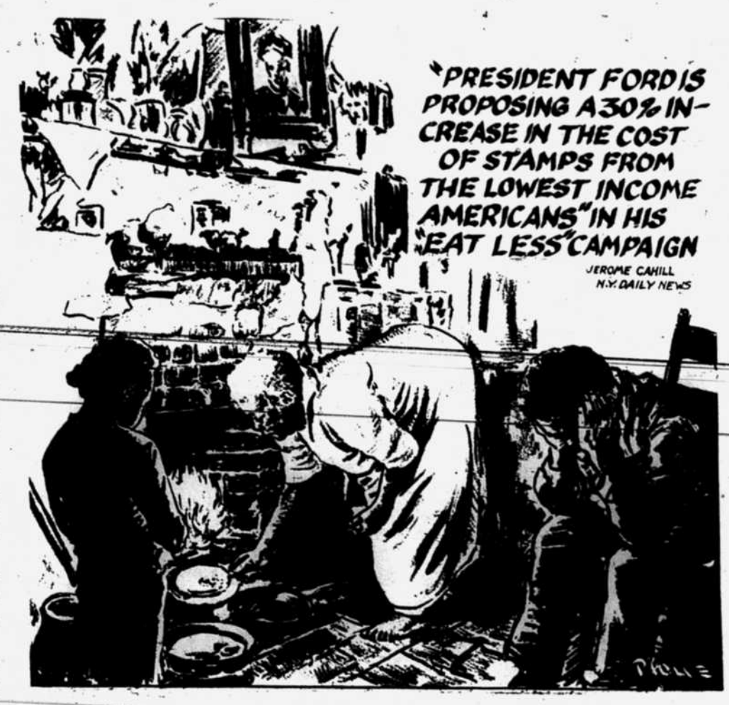
Drafting America's Poorest

... Such a gift, manifest in concrete deeds and terms throughout the year, could go a long way in warming that many more Black family circles-large and small-in years to come.