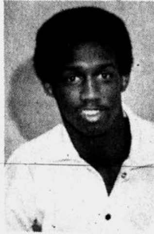
CALVIN JOHNSON ...Turns it on