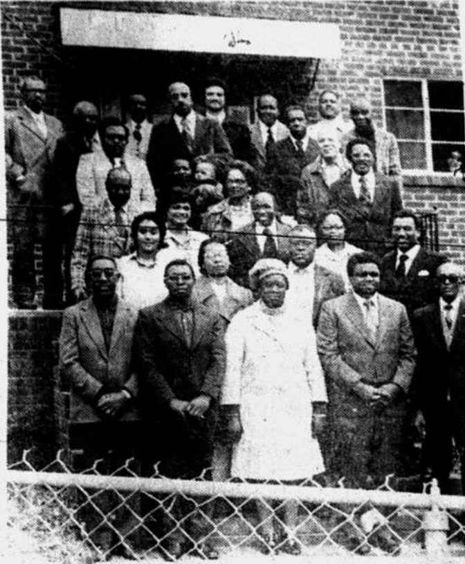
SHAW DAY STEERING COMMITTEE ...See Story On Page 1