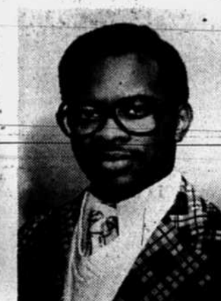
CLARENCE CHISHOLM ... Post Staff Writer