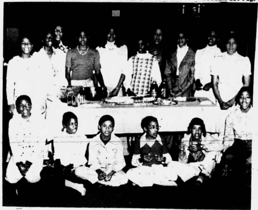
EASTER MIXER FOR YOUNG SET

Reservations for the luncheon, last in the international series, may be made through Monday, April 7, by calling the Y at 525-5770. Tickets are $3 for Y members, $3.25 for non-members, with proceeds to go to the International YWCA program.