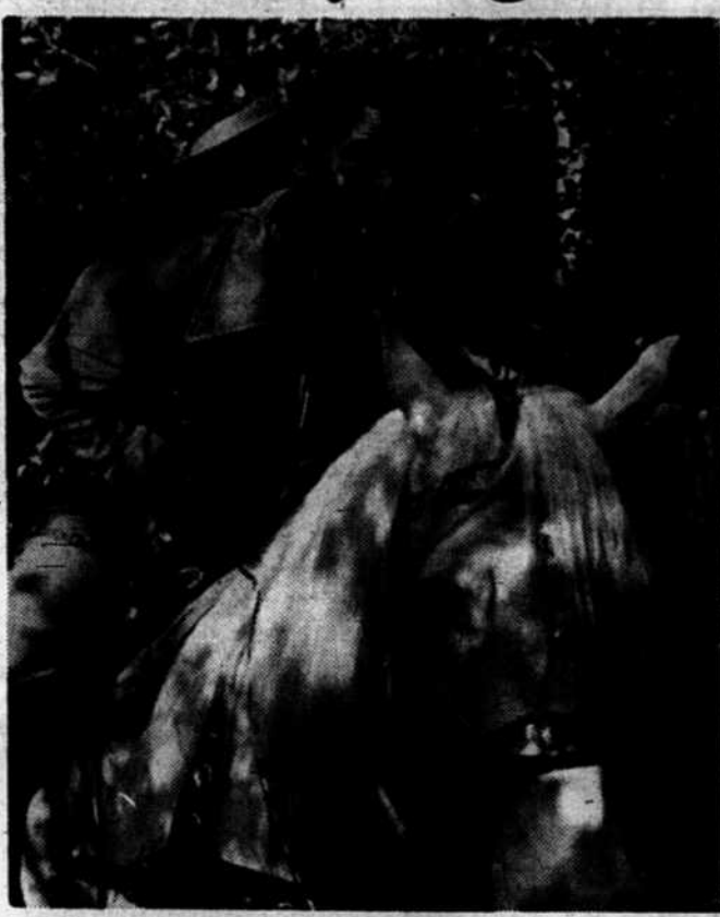
THE WEST'S FIRST BLACK SHERIFF - Lou Gossett stars in the hilarious half-hour comedy "Black Bart," Friday, April 4, at 8 P.M. ET on CBS-TV.

"It's better to teach through comedy than through tra-