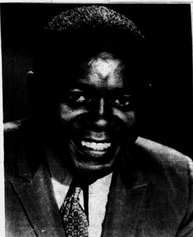
FLIP WILSON...Top Entertainer