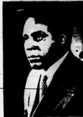
VERNON E. JORDAN JR.