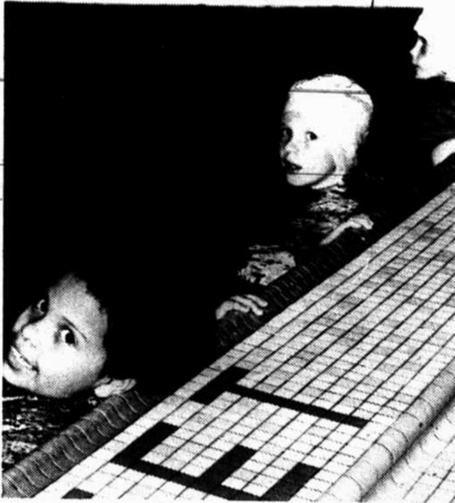
HAPPY YOUTHS relaxing in the olympic sized swimming pool at the YWCA, 418 E. Trade Street.

Classes, beginners through advanced, are held daily except Sunday at both centers. Registration for swim classes will be taken this Saturday and next Monday through Wednesday during the regular summer sign-up at both Us.