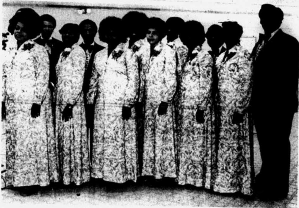
WILSON HEIGHTS GOSPEL SINGERS ...Performed at 40 Different Churches

How much does it cost you to give your full support to the Charlotte Post? Only $8.00 per year - the purchase price of a year's subscription. Be sure to get your copy each week. YOUR SUPPORT HELPS!