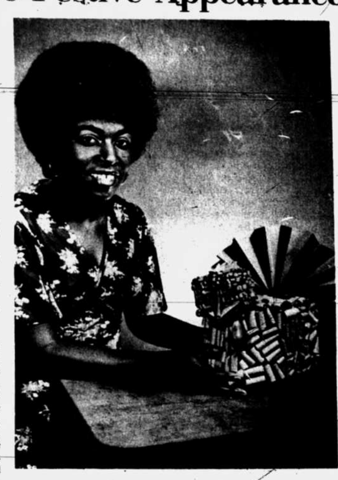
PROFESSIONAL MODEL ...With unique turkey centerpiece

small carton, notch the paper to look like feathers and glue it in place on the top of the small