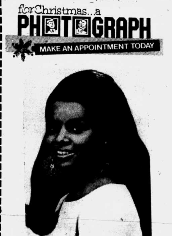
First ....For Fine Photography