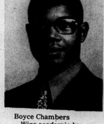
...Wins academic honors