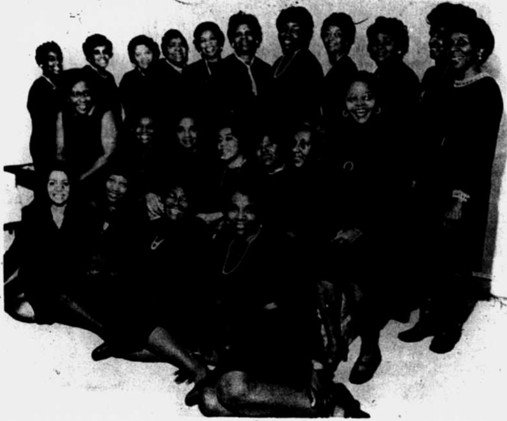
ALPHA BETA CHAPTER

Until I speak to you again be kind to yourselves and ROCK EASY!!