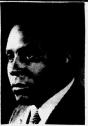
VERNON E. JORDAN JR.