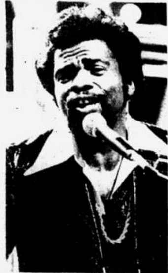
Billy Preston ...Popular entertainer

Blending sight and sound, SKY SHOW '76 features a massive fireworks display from the top of Charlotte's NCNB Tower. The aerial bombs are synchronized to explode in time to a program of music and words on 1110 WBT Radio. The musical program includes patriotic selections celebrating America's past, present and future.