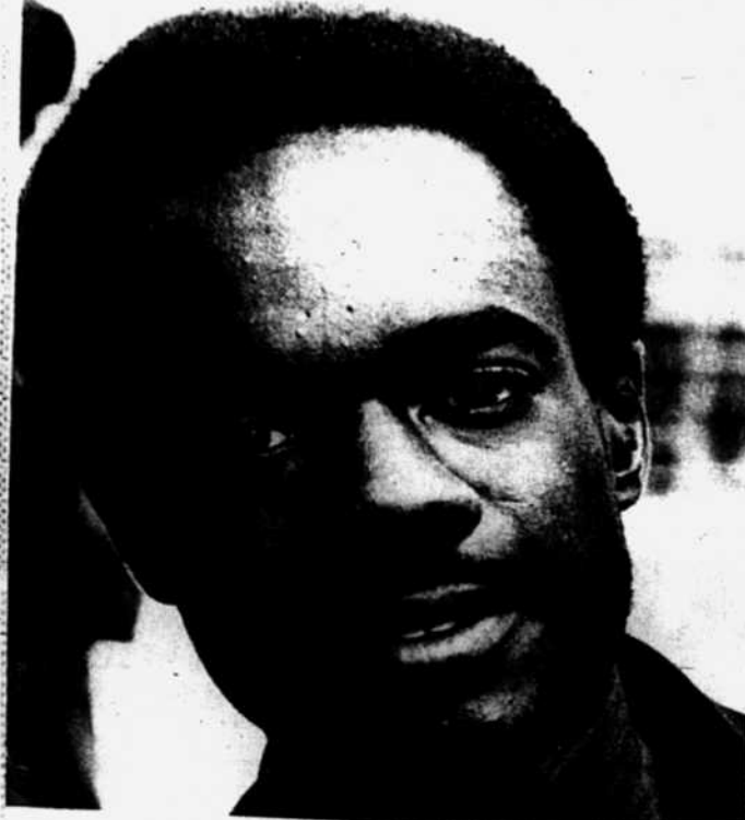
portrays a young man who is working his way through law school as a cab driver, volunteers to go up on the stage in a nightclub featuring a hypnotist. In a trance he experiences the bloody event of more than 30 years ago - which serves as the precredit sequence to "J.D.'s Revenge" a well made, ingenious thriller now showing at the Carolina Theatre downtown.

The man who said "Opportunity knocks but once" probably understood the importance of taking advantage of all those things that may some day play a great part in many success stories. It is up to the individual who strives to upgrade his life and improve his destiny to know and fully understand the meaning of opportunity and to realize that he must take advantage of all that life has to offer.