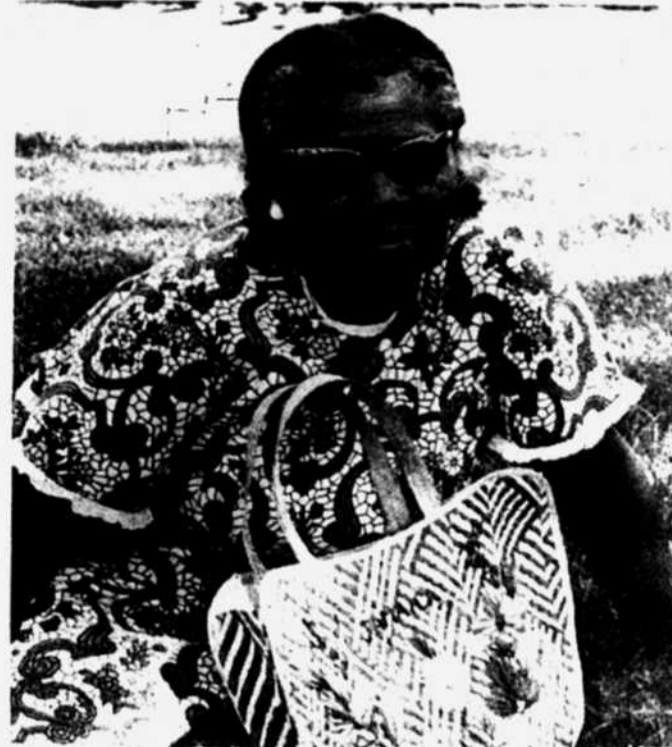
TIRED SPECTATOR RELAXES ...At Afro-American Festival

City Councilman Harvey Gantt kicked-off the day's program with a welcoming speech.