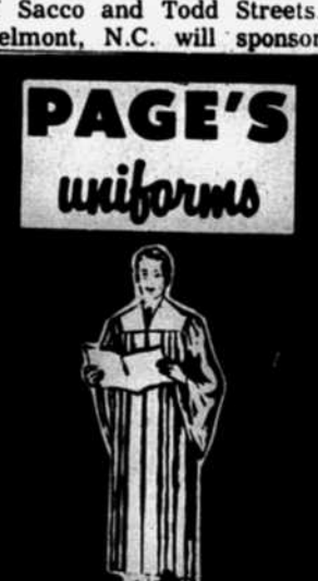
See PAGE'S for CHOIR ROBES

The Pastor and members of Hood Memorial A.M.E. Zion Church located on the corner of Sacco and Todd Streets,