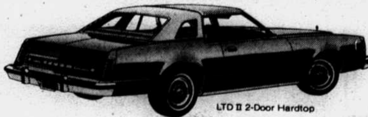
LTD II 2-Door Hardtop