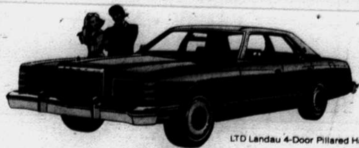
LTD Landau 4-Door Piliated Hardtop

†Not available in California or high altitude areas