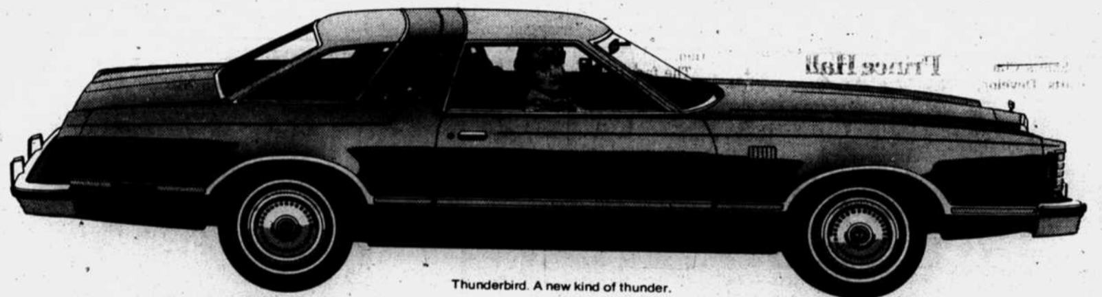
Thunderbird. A new kind of thunder.