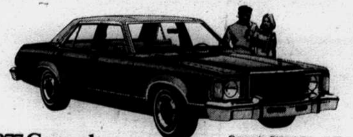
Granada Ghia 4-Door Sedan

For a 6-passenger car that's trimmer in size and price than LTD, choose Ford's new LTD II. It combines LTD's high level of workmanship with a sporty spirit all its own. Full size or trim size, your Ford Dealer has both.