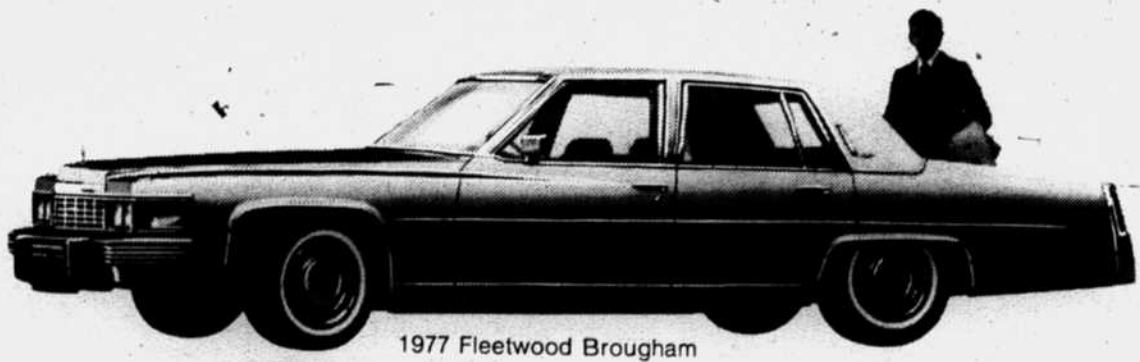
1977 Fleetwood Brougham

Cadillac introduces the next generation of the luxury car.