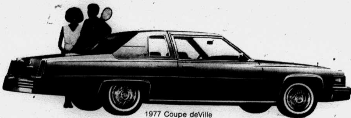
1977 Coupe deVille

Introducing Cadillac 1977. The brilliant new Fleetwood Brougham with four-wheel disc brakes. The sleek new Coupe deVille. And the stunning new Sedan deVille.