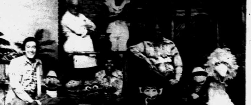
"SESAME STREET" HOSTS GATHER FOR NEW SEASON