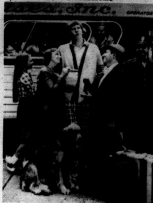
Spending kids through four years of college can cost anywhere from $10,000 up depending on where they go to school.