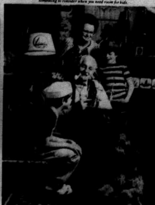
In a working life, you make hundreds of thousands of dollars. So why shouldn't your money work when you retire.

Over your lifetime, you'll have a lot of money coming in. And a lot of money going out. Sometimes, you'll have more than you need. Other times, you won't have enough. And, in this lifelong battle of income vs. outgo, a bank can help you in a lot of ways. By looking at things more from your point of view. And less from the bank's point of view.