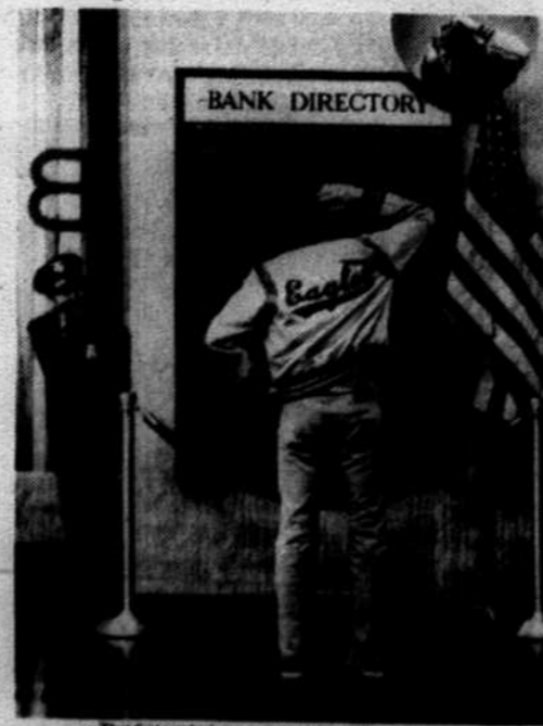
That first payback can seem pretty big, until you start paying for your new food, clothes, and housing.