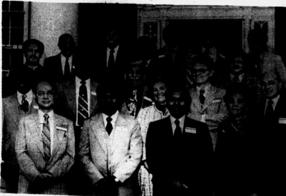
Pictured above at the October 1976 meeting in Atlanta are the Members of the Board of Overseers for the Morehouse College Medical Education Program. The program, planned to become the third predominantly black medical school in the country, will admit its first students in September of 1977.

Keep your out-of-town friends informed on what's happening in Charlotte by sending them a copy of the Charlotte Post each week. The cost is only $8 per year.