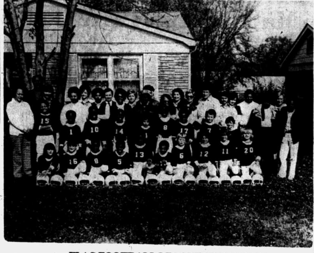
FLAG FOOTBALL LEAGUE CHAMPIONS

.... With parents, coaches at victory party