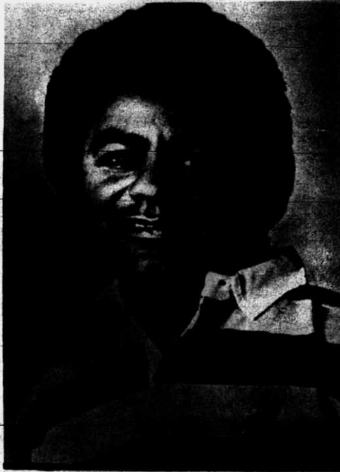
SINGER JOHNNY MATHIS ...All time great

Tickets for the performance, which are priced $1.50 may be purchased a week in advance at the Children's Theatre, 1017 E. Morehead Street from 10 a.m. to 2 p.m. or at the door.