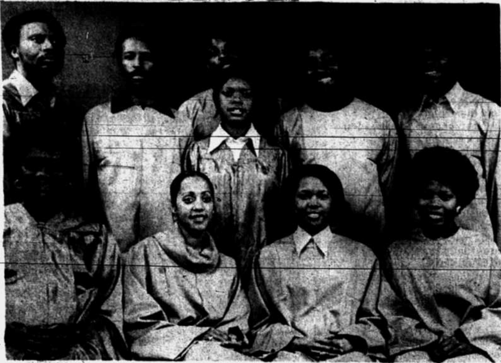
EBONY GROUP AND COMPANY Charlotte area representatives