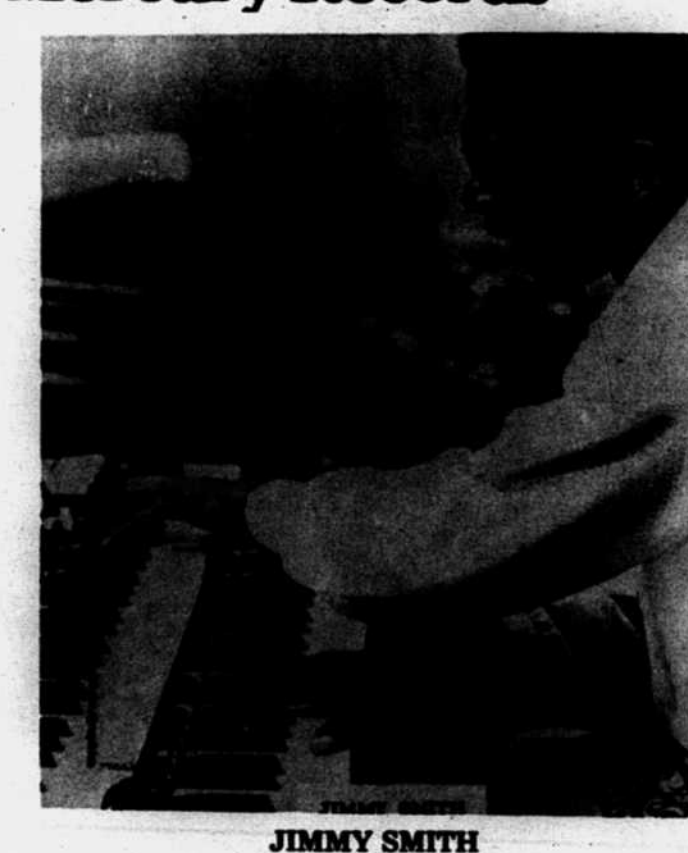
... Famed organist

Smith's fame and popularity was further heightened over the years with his outstanding recordings of "The Sermon," "Walk On The Wild Side," "Organ Grinders Swing," "Respect," and so many more that made him one of the top selling album artists, in addition to his popularizing the Hammond electric organ as a musical voice of authority.