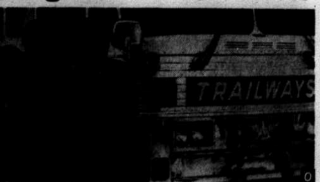
LeVar "Kunta Kinte" Burton with his arms around his mother and his fiancée.

Never have so many Americans been interested in going "home," thanks largely to Alex Haley's world-famous search for his ancestral roots.