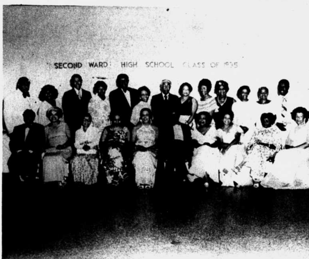
MEMBERS OF SECOND WARD'S 1935 CLASS

The concluding day, Monday, consisted of a brief memorial for deceased members of the class and former faculty members. This was followed by a Brunch and Champagne Sip at the Excelsior Club. Games, (Bridge, Pinochle and Bingo) were played.