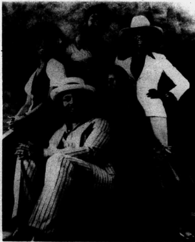
ANDRAE CROUCH ...With his Disciples

Contemporary music, however, is breaking those boundaries, particularly in the soul gospel areas. An "Andrae Concert" will move from hymn-like ballads to rock revival peak which brings crowds to their feet. The style is so different throughout, you'd think there were several dif-