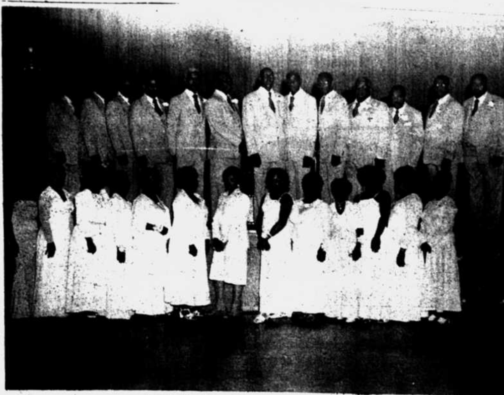
THE TOP HATTERS CLUB