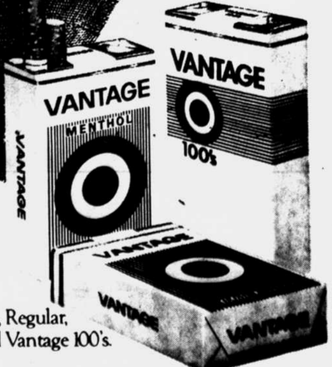
Menthol, Regular, and Vantage 100's.