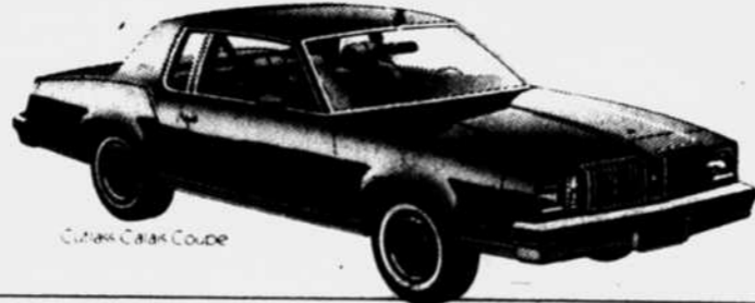
Cutlass Calais Coupe