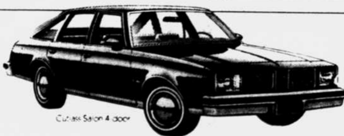
Cutlass Salon 4 door