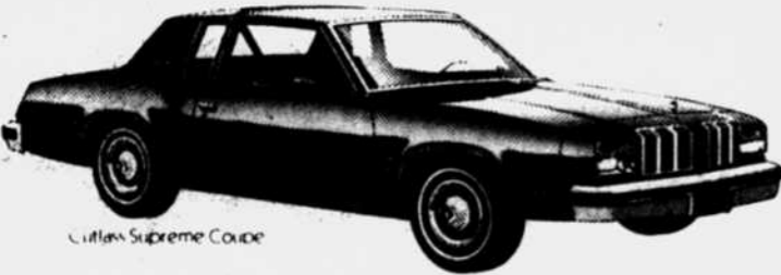
Cutlass Supreme Coupe

Cutlass Supreme Brougham. The kind of elegance and comfort you expect in an expensive luxury car—now in an agile, practical mid-size car. Make plans to test drive a 1978 Olds Cutlass soon.