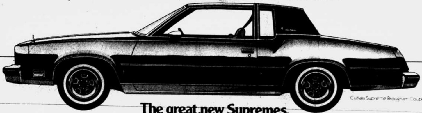
The great new Supremes.

DISCOVER THAT GREAT CUTLASS FEELING! Take a test drive at your Olds Dealers.