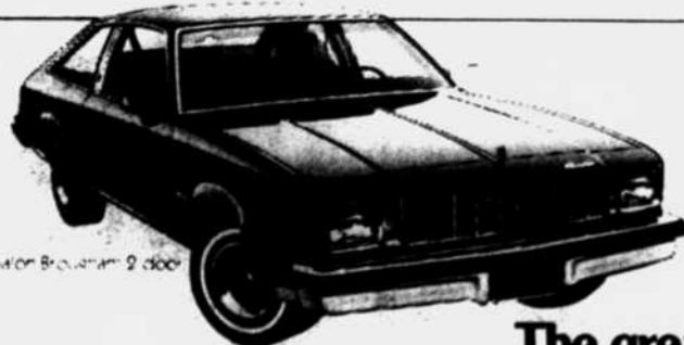
Cutlass Salon Brougham 2 door