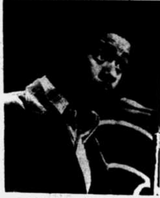
Richard Pryor ...Can't cope with pressures

On The TV Scene: A noted psychic predicts that comic Richard Pryor is headed for a nervous breakdown because he can't cope with the pressures of stardom... "You know what time I woke up today?" Cicely Tyson asks, shaking her head. "It was 3:17 a.m.—a whole hour early! Oh yes, I do 6 to 10 miles of running every morning. I can't start the day without it. It gives me tremendous energy. When I've finished, I feel I've paid the price of living and I can go on." Cicely Tyson, no doubt about it, is an intense, even driven lady. She's far from humorless, though. She has a dazzling grin she rarely allows to be worn by the suffering, triumphant characters she plays. "I was the bane of my mother's whole existence"—the smile is rueful now—"I'm telling you truly, I drove her crazy with my driving schedules." Her parents came from Nevis, one of the British West Indies islands, and they were strict disciplinarians. Her mother worked as a domestic and her father worked as a