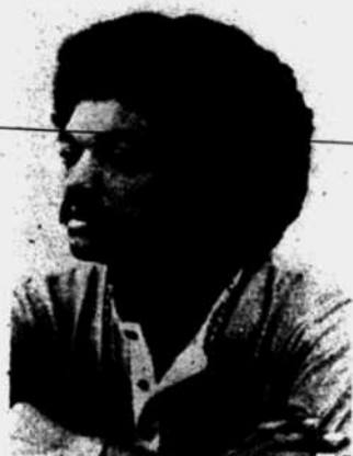
Rev. Jesse Jackson ...Civil rights Activist

When Diahann Carroll last appeared on the Johnny Carson Show, she recalled how she once sang in Harlem's Abyssinian Baptist Church Choir and how much she admired its pastor, the Rev. Adam Clayton Powell, Jr. That's why the Adam Clayton Powell, Jr. Memorial Committee is trying to get her to show up on Wednesday, Nov. 29, when a Memorial honoring the late Congressman's 70th birthday will be held in the Harlem State Office Building.