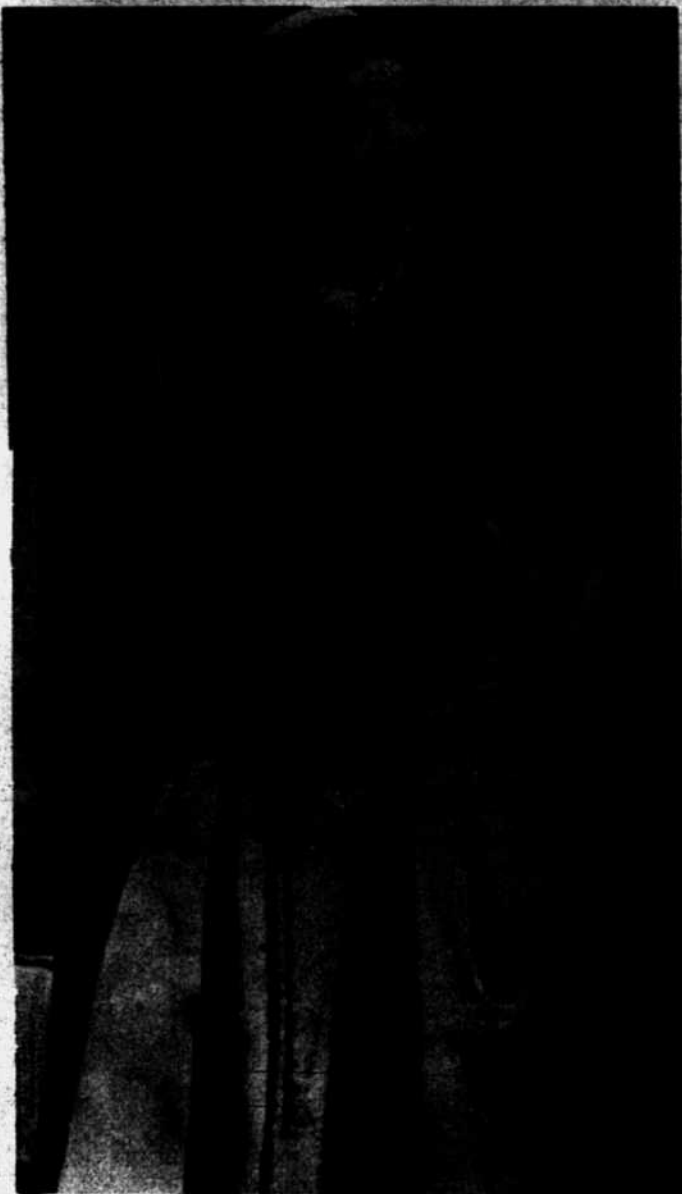
Charlottean Josie Hudley gave an outstanding performance in Bennett College's production of "Plantation." She played the role of a money-loving bishop in the New Orleans plantation area during the early civil rights movement.