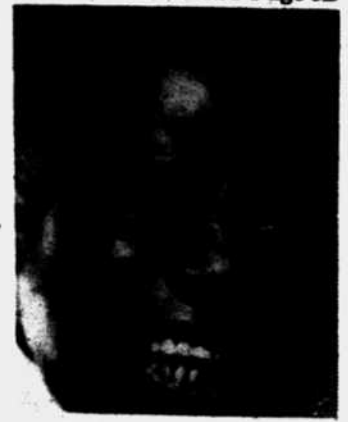
Louis Armstrong ...Jazz band leader