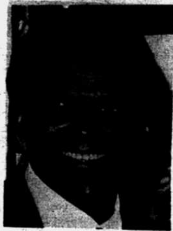
Harry Belafonte ...To produce TV programs

The McDonald's All-American High School Band performed again this year at the Macy's Thanksgiving Day Parade in NYC and on New Year's Day will march in the