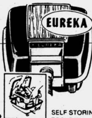
SELF STORING TOOLS IN LIFT OUT TRAY!