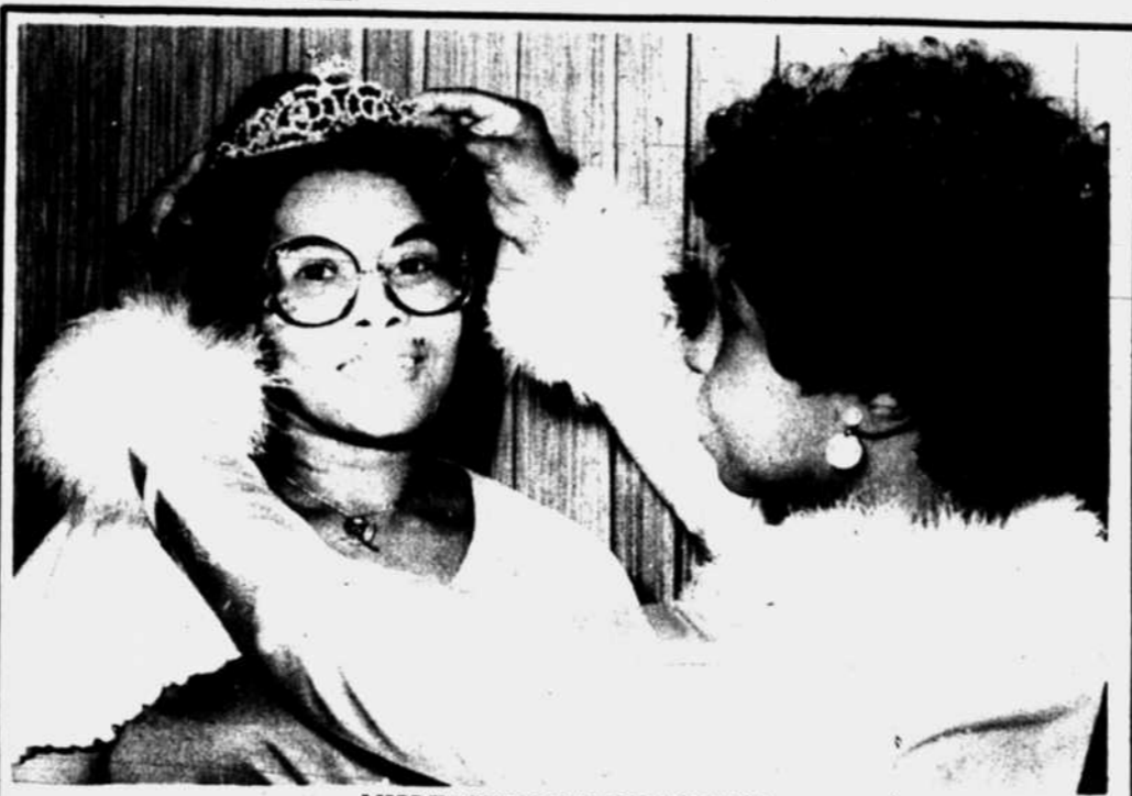
MISS EASTERN STAR PAGEANT

12 Noon Tuesday is the deadline for placing your news items and photos in the Charlotte Post.