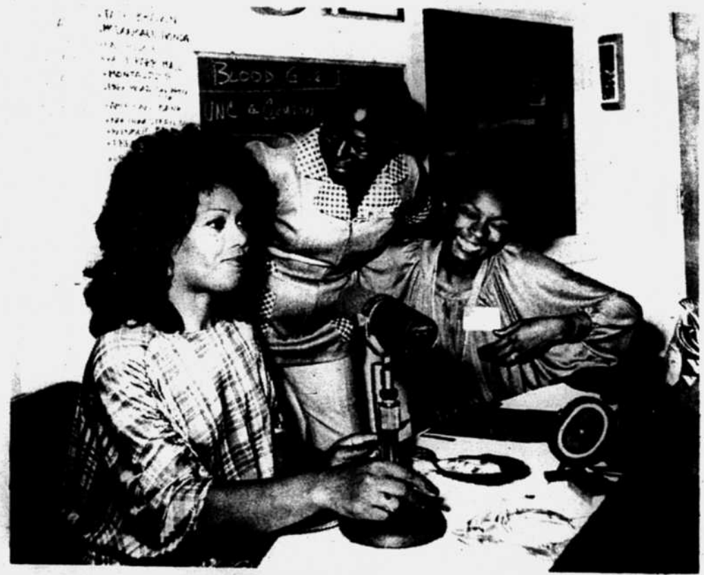
GORGEOUS JA'NET DUBOIS