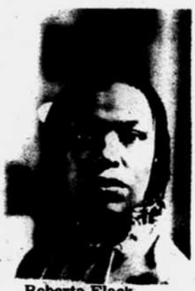
Roberta Flack ....Going great

include: Foreigner's "DOUBLE VISION," The Rolling Stones' "SOME GIRLS," ABBA's "GREAT-EST HITS" and "ABBA: THE ALBUM," "TORMATO" by Yes, and Chic's "C'EST CHIC."In addition, two 1978 releases, "ELAN" by Firefall and the Blues Brothers' "BRIEFCASE FULL OF BLUES," were officially certified platinum in the first week of January, 1979. Gold LP certification was awarded to: