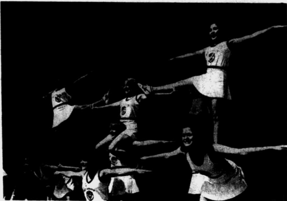
West Charlotte High School competed Saturday in the Fourth Carowinds Cheerleaders Championship at Carowinds theme park. This championship attracted 61 competing squads making it the largest championship of its kind in the country.

GOLF TOURNAMENT... The Par-Busters organization will be hosting their 4th annual Four-Ball Tournament Saturday and Sunday, April 6 and 7.