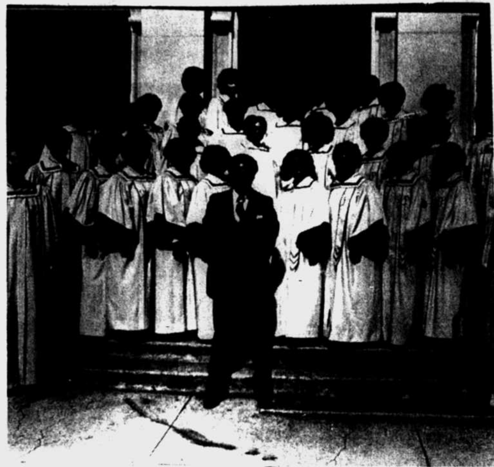
ST. PAUL BAPTIST