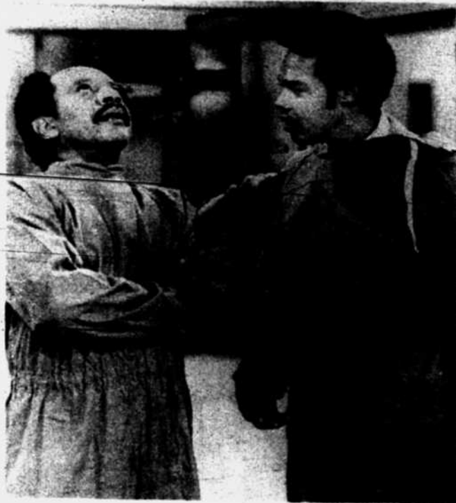
George Jefferson (Sherman Hemsley) discusses maternity matters with Lionel (Mike Evans), on "The Jeffersons," Sunday, Feb. 10, on CBS.

(Stations reserve the right to make last-minute changes.)