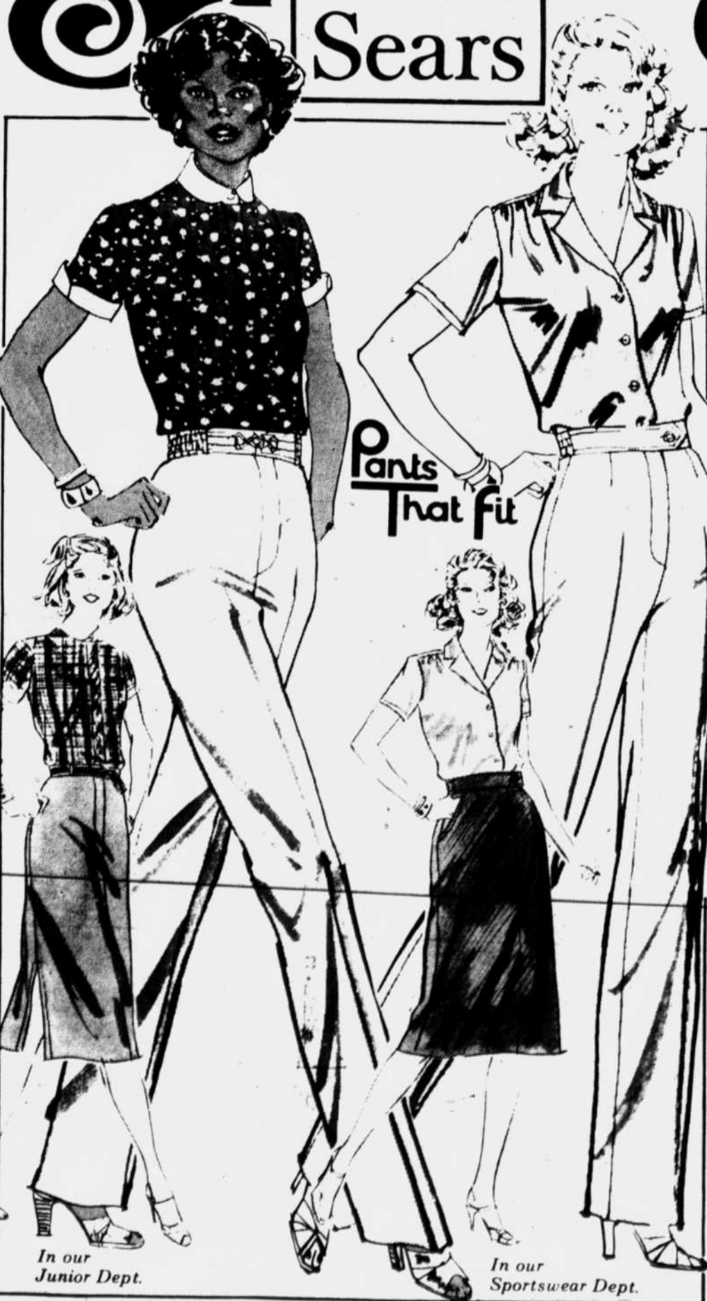
In our Junior Dept.