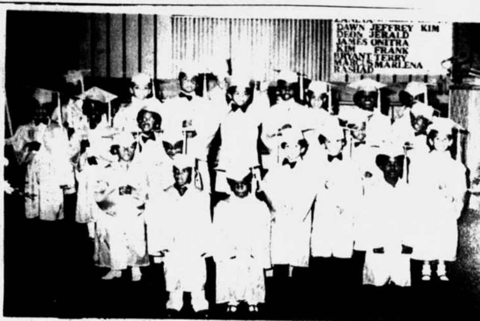
FRIENDSHIP DAY CARE CENTER GRADUATION

The groom is also a graduate of the University of North Carolina and majored in psychology